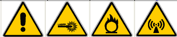
Pericolo generico/ General danger Raggi laser/ Laser Beams Materiale comburente/ Combustive material Radiazioni non ionizzanti/ non ionizing radiation