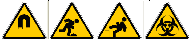
Campo magnetico intenso/ Strong magnetic field Pericolo di inciampo/ Danger of stumbling across obstacles Caduta con dislivello/ Beware drop below Rischio biologico/ Biological risk