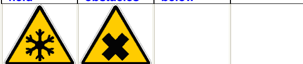
Bassa temperatura/ Low temperature Sostanze nocive irritanti/ Harmful or irritant materials