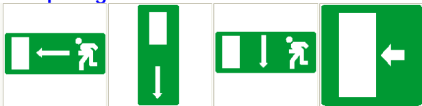
Percorso/uscita di emergenza – Emergency Exit /Escape route